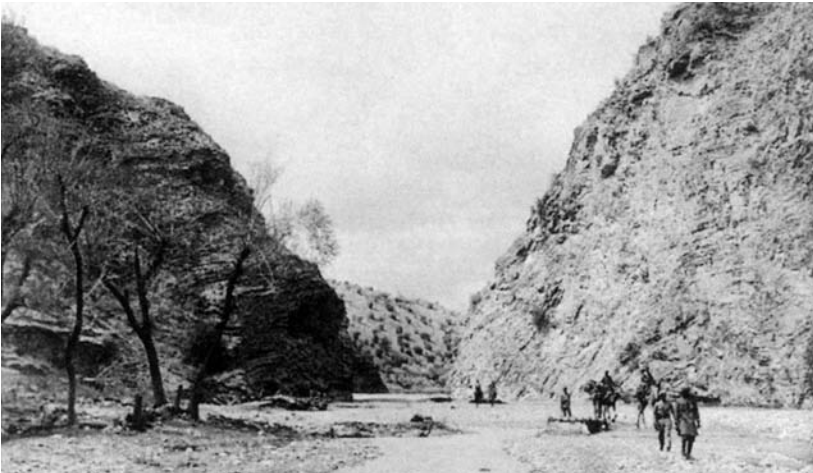
Dominating terrain for a march column (NAM 98080)