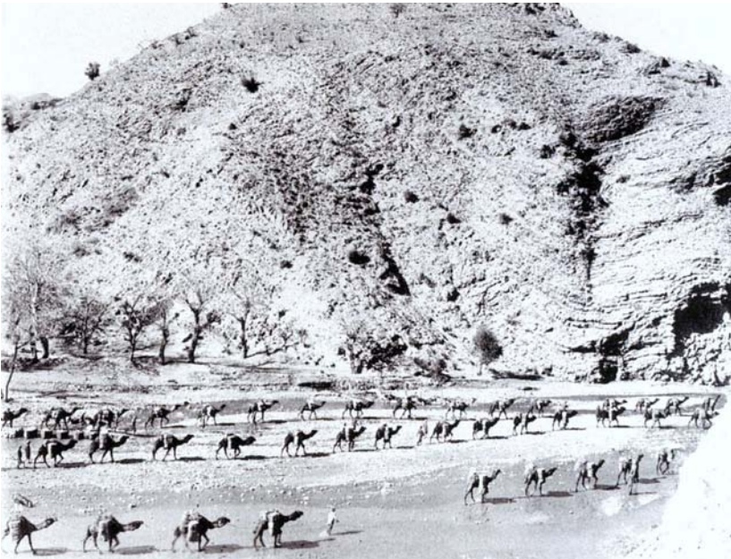
Camels and their handlers in march columns (NAM 99810)