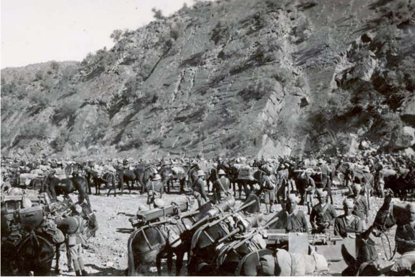
Pack mules ready to march with 48th Regiment (Sgt Partridge)