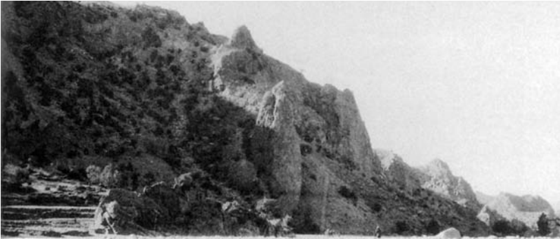
Mountainous terrain (NAM 96899)