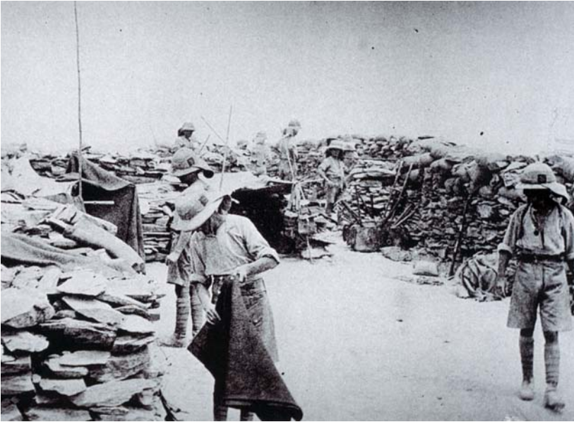
Interior of sanger occupied by picquet (NAM 60338)