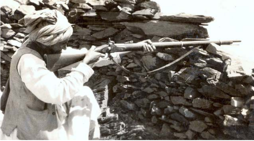
Tribesman posing in sanger