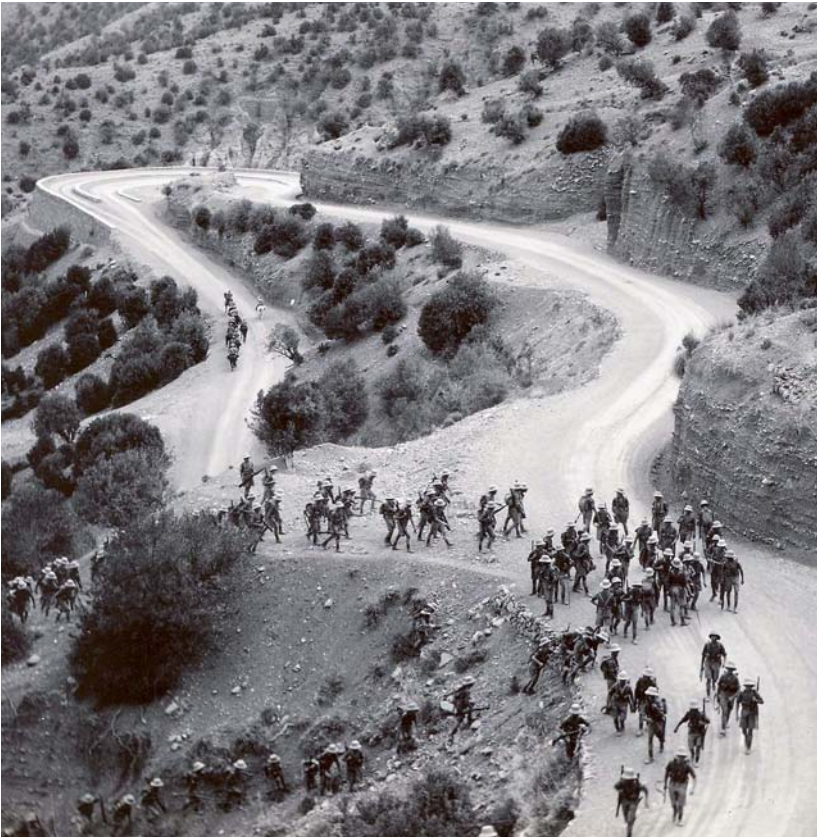
48th Regiment takes a short cut